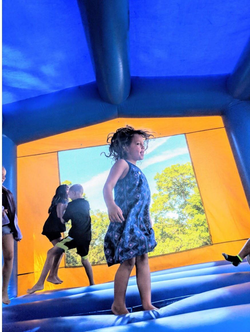
(Church picnic at Emanuel 2019)

Emanuel Church Picnic after worship at Emanuel food, fun, friends